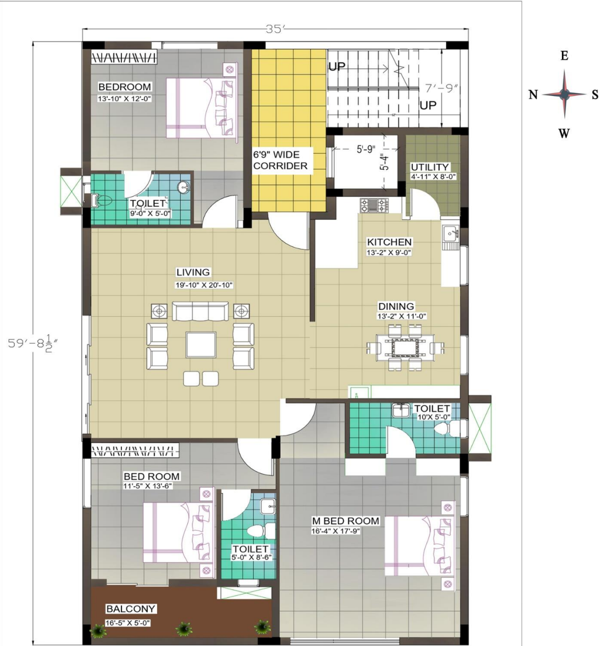
FIRST AND THIRD FLOOR PLAN